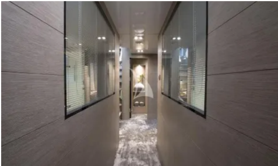
access/ corridor to cabin