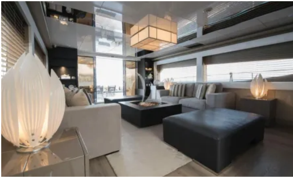
Salon - main deck