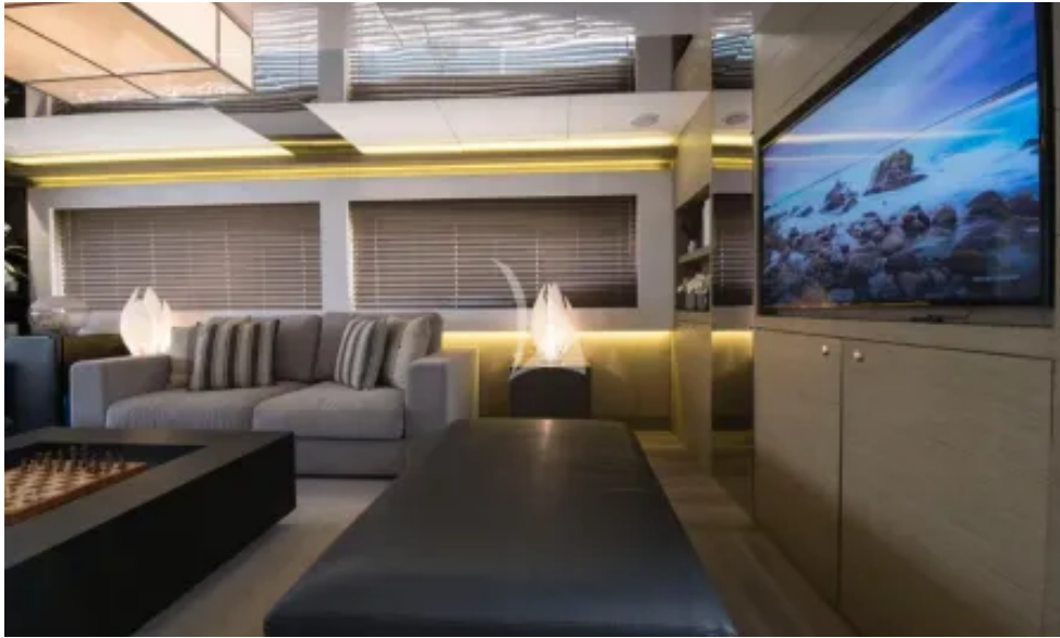
Salon - main deck