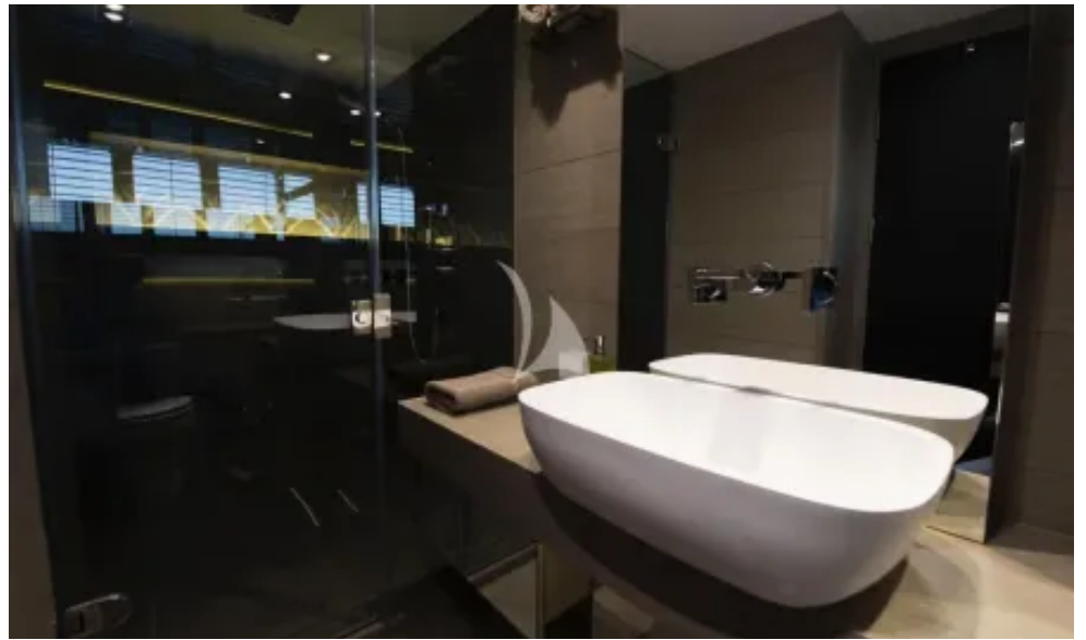
bathroom master cabin