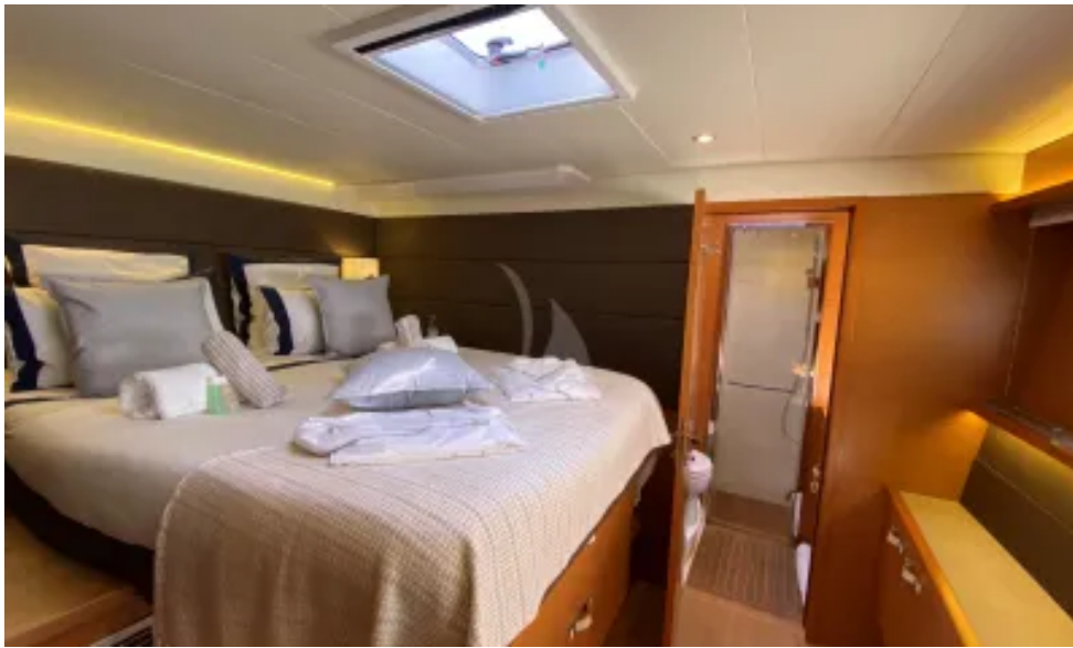
Front cabin 1