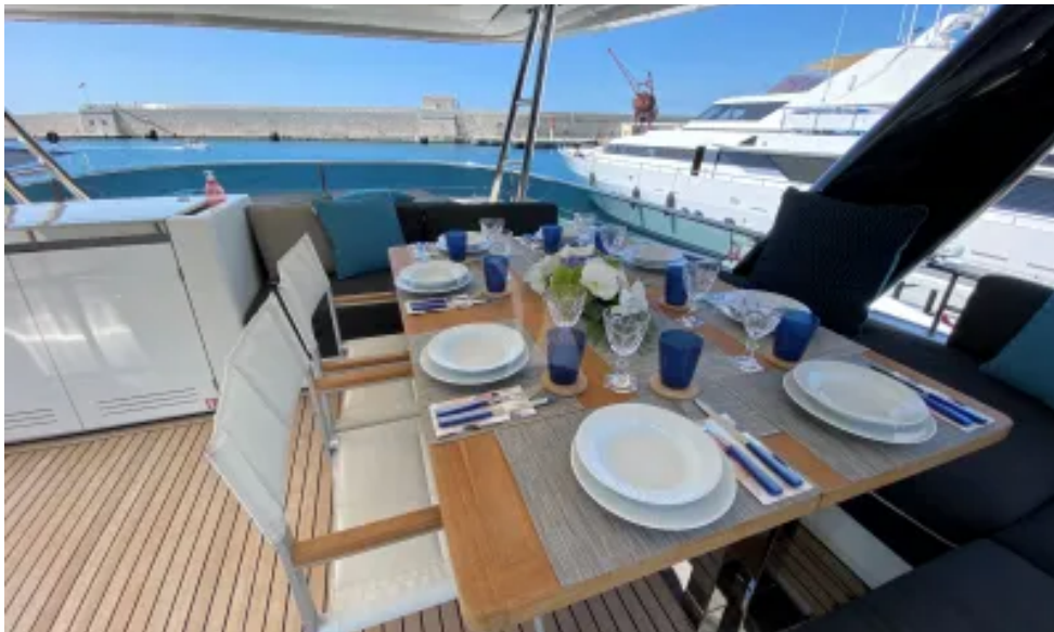
Dining table Flybridge