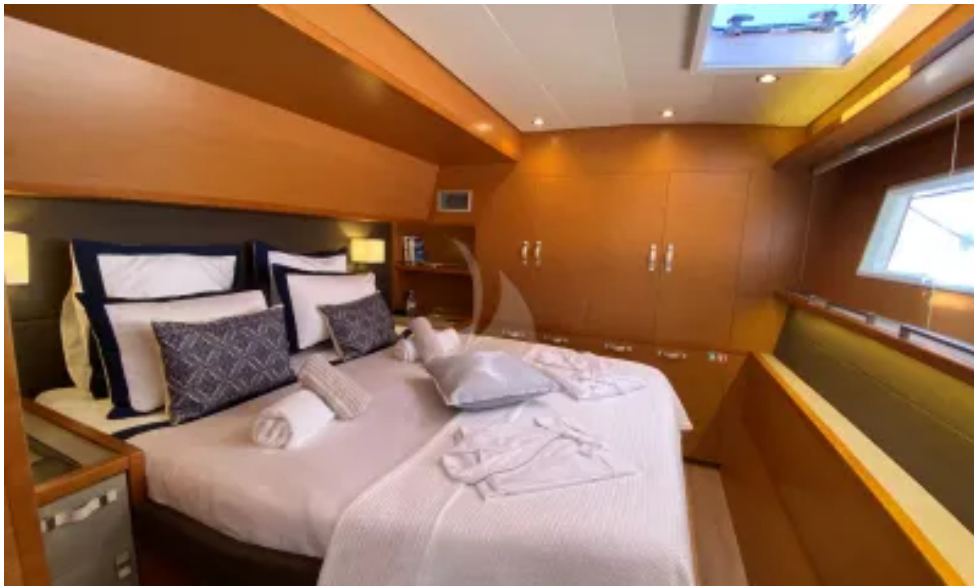
Master - Aft