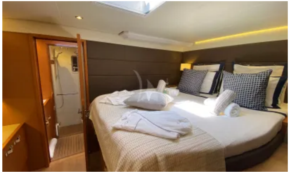
Front cabin 2