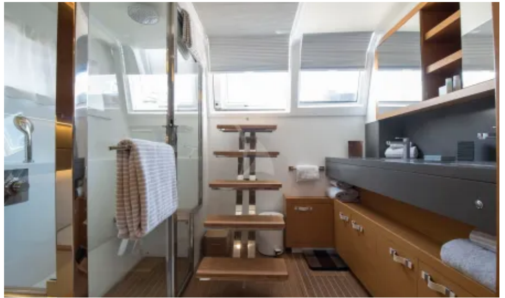
Open bathroom - Master cabin