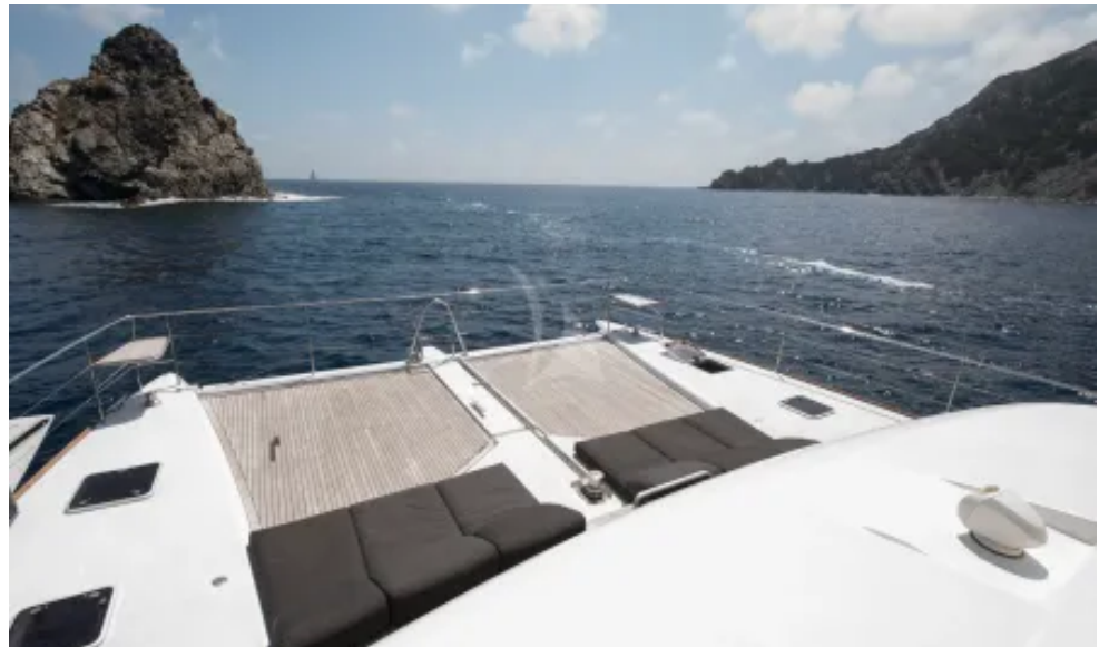
Front platform with sunbeds