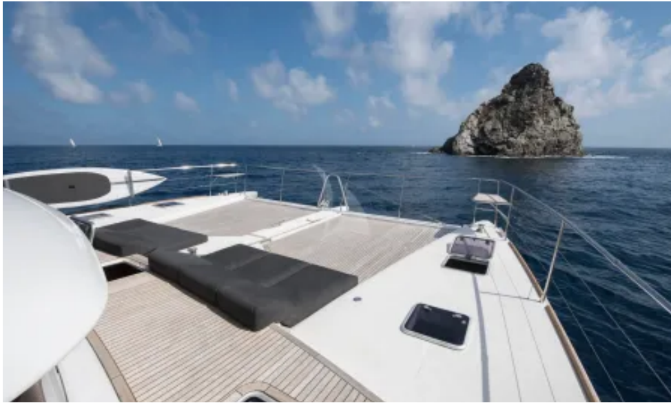
front platform with sunbeds