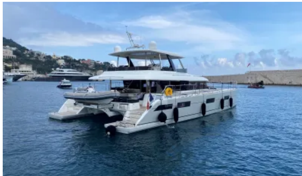
Leaving the Port