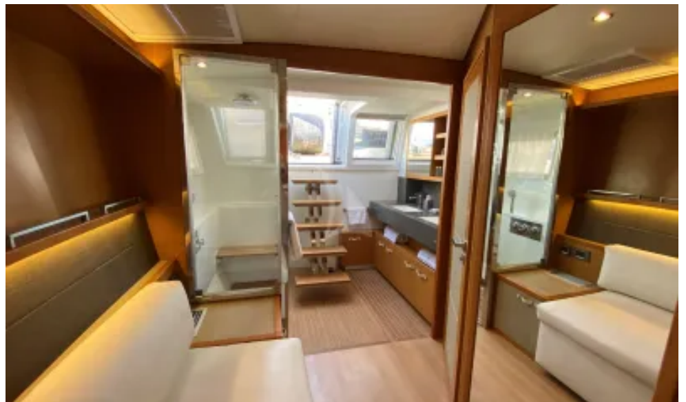
Master - Aft