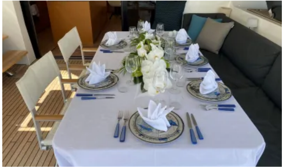
Dining table Aft Deck