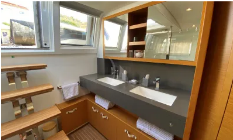
Master - Aft