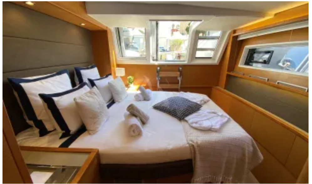
VIP - Aft