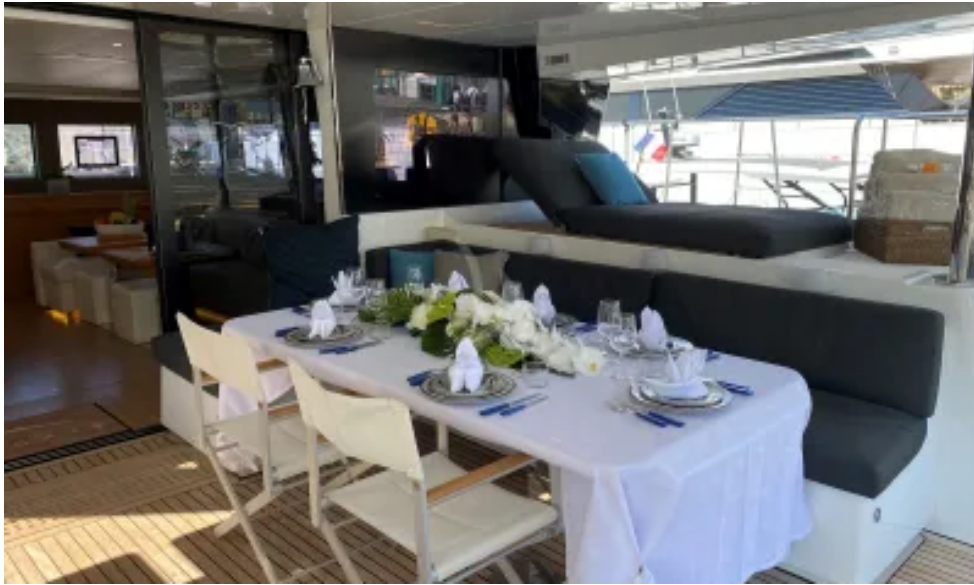
Dining table Aft Deck